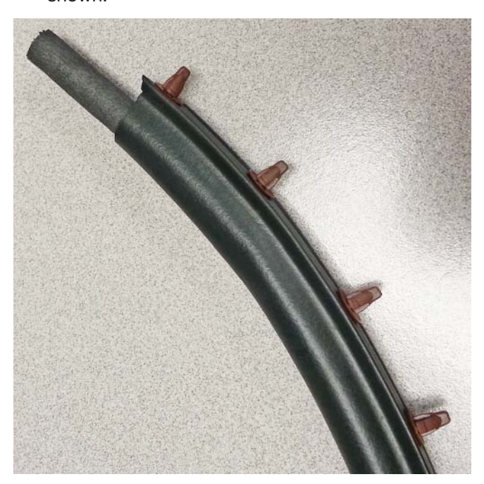
16. Install the air box seal starting in the location shown. You may need to trim your seal to the correct length. (NOTE: Start the seal at the middle of the inlet tube.)

15. Insert the seal filler (P/N: 1115-9B624FOAM) halfway into the air box seal (P/N: 1115-9B624) as shown.