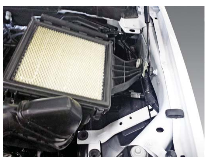
11. Remove the self-tapping screw retaining the dirty air inlet onto the lower air box.