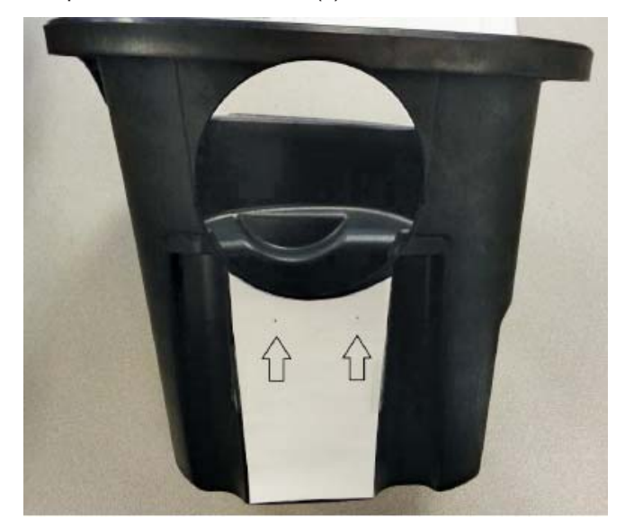
5. Drill the holes out using a 17/64" drill bit.