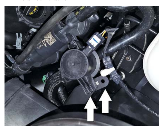
14. Reinstall the two (2) push pins into the dirty air inlet.

13. Clip the harness and vacuum line into position on the air box bracket.