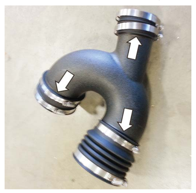
12. Install the clean air tube assembly between the throttle body and the air box. Tighten the clamps to 3 Nm.

11. Install couplers and clamps onto the clean air tube (P/N: 1115TT-9B660) as shown. Tighten the clamps retaining the coupler to the tube to 3 Nm. Leave the outside clamps loose (coupler: top P/N: 1115TT-9B663, bottom P/N: 1115TT-9B661, left P/N: 1115TT-9B662) (clamps: top P/N: R07130028-13, bottom P/N: R07130015-13 and P/N: R07130028-13, left P/N: 308707426).