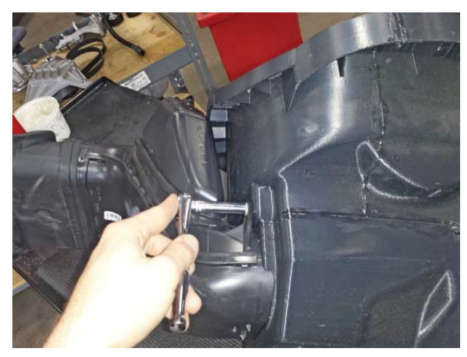
IMPORTANT: Do not remove the shown silencer rings.

1. Insert the dirty air inlet into the Roush air box (P/N: 1115-9A612). Reuse the self-tapping screw that was removed earlier. Tighten to 3 Nm.