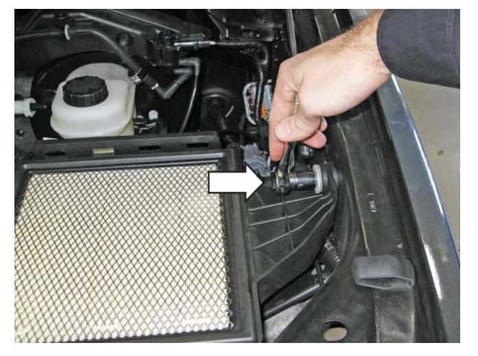
9. Remove the two (2) push clips retaining the dirty air inlet duct to the grill closeout.

8. Remove the bolt retaining the stock air box to the inner driver side fender. Retain the bolt, sleeve and grommet for later use.