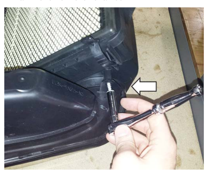
12. Remove the dirty air inlet from the lower air box.