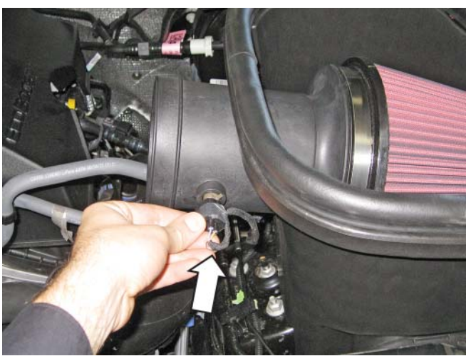
10. Install the two (2) M8 bolts (P/N: W500224-S437) and tighten to 10 Nm.