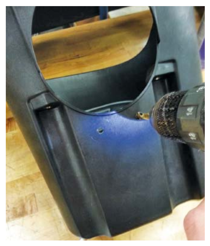
Mount the bracket (P/N: 117-9B611) to the outside of the air box using two (2) M6 bolts (P/N: W500013-S307). Torque to 10 Nm.